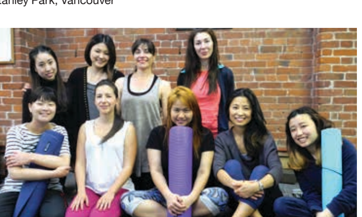
Yoga class at SELC Vancouver