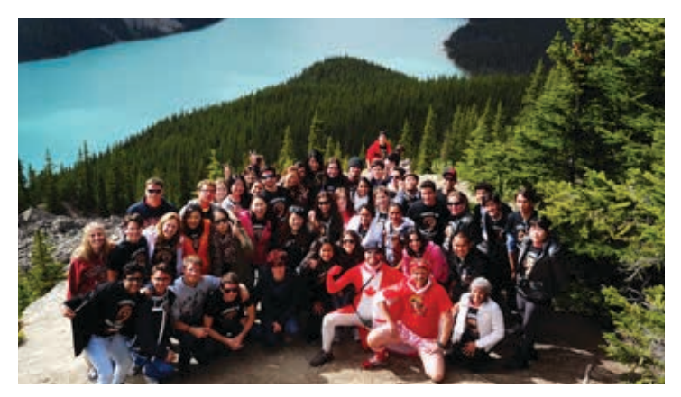
Rocky Mountains, Kelowna